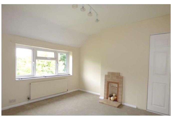
Bathroom with bath, wc, wash hand basin.

Three Bedrooms (two double and one single) each with built in cupboards. The principal bedroom having a feature fireplace (sealed).