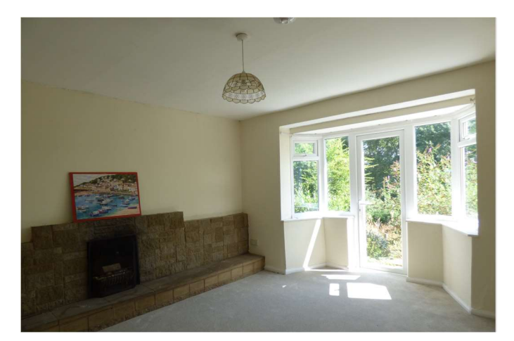
set in attractive gardens in a popular village.

The house is set back on village lane and approached by gravelled drive with a lawned area to the side. To the back is a further good-sized garden.